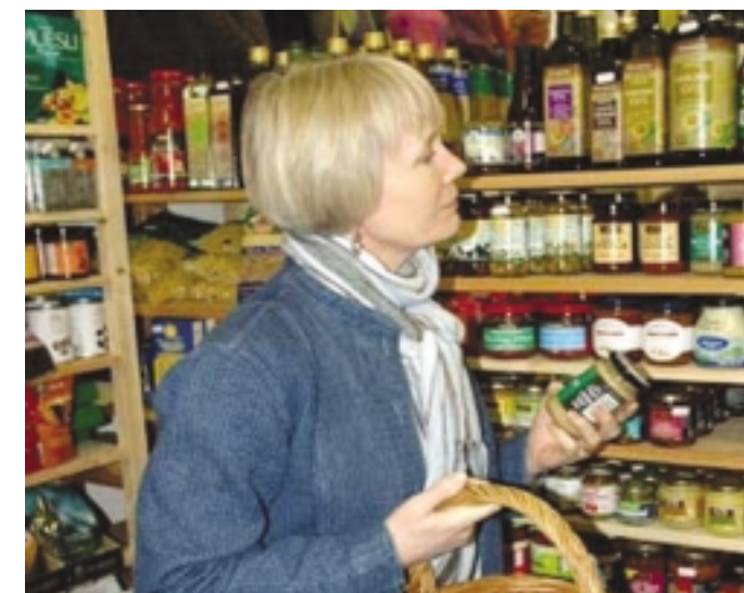
Just Trading, Wallingford

Just Trading of Wallingford opened for business in October. The members of the co-operative each work in the shop on a rota basis.