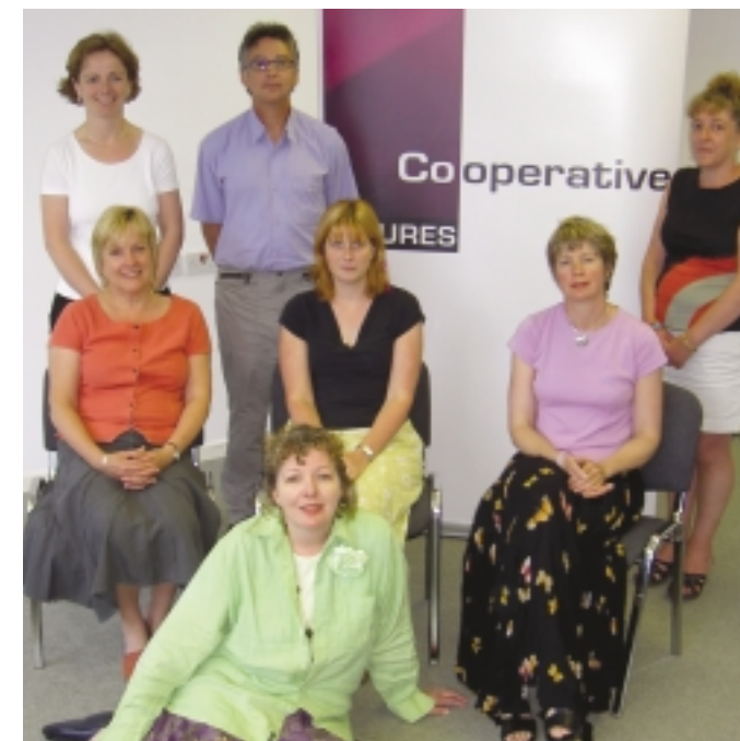
Co-operative Futures Team

In the past year we have introduced a more comprehensive method of evaluating our services and our thanks go out to those of you who have participated in