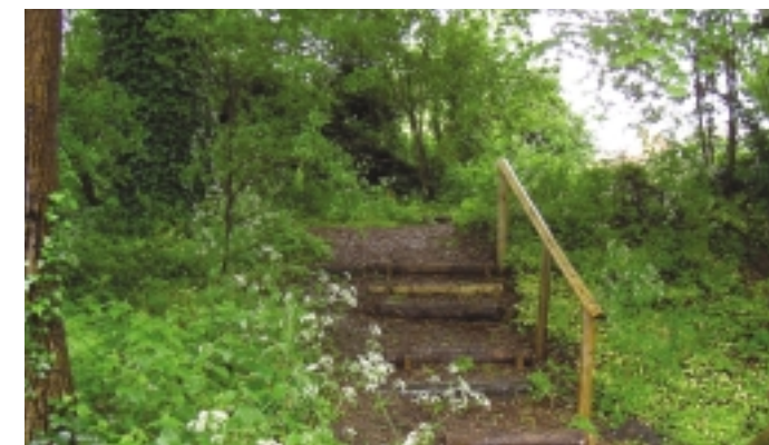
Bruddel Woods, Swindon

employment, but who have identified their own personal need for a period of transition to build up their work skills and confidence levels.