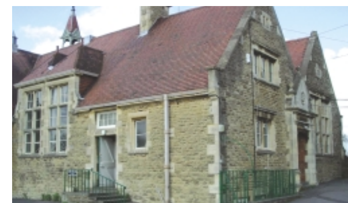
The Pound Arts Centre, Corsham

Originally a primary school, the site owned by the District Council was taken over as an arts centre 10 years ago. The funding will allow the arts organisation to upgrade the facilities available for use by all of the community. Physical improvement works have now begun and will take 12 months to complete. In addition, Co-operative Futures worked with the arts organisation