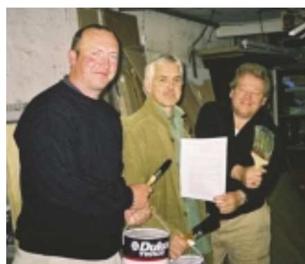
Signing up: Gloucestershire Contracting Partnership

– what councils etc call 'procurement'. The co-operative allows businesses to bid jointly for much bigger contracts than they could manage on their own. With so much emphasis now being placed on keeping money in the local economy, this may well be the shape of businesses to come.